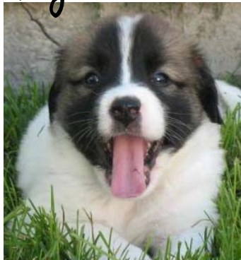
St. Bernard Mix Pups (5 pups) Owner Surrender Adopted August 2007