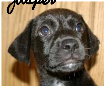
Lab/Jack Russel Puppies (5 Pups) Rescued from Shelter Adopted August 2007