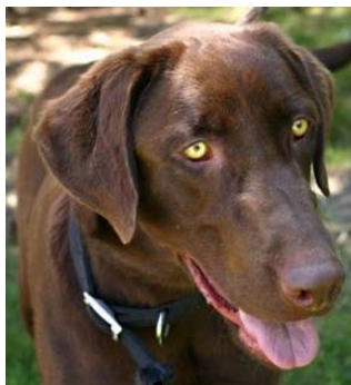
Male Chocolate Lab Rescued from Euthanization Adopted September 2007