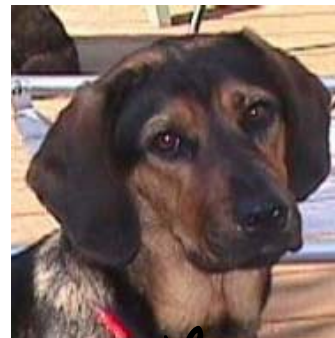
Female Basset Hound Mix Rescued from Euthanization Adopted August 2007