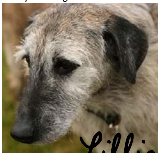
Female Irish Wolfhound Mix Rescued from Hoarder Adopted August 2007