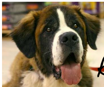
Male St. Bernard Owner Surrender (father of St. Bernard pups) - Adopted September 2007