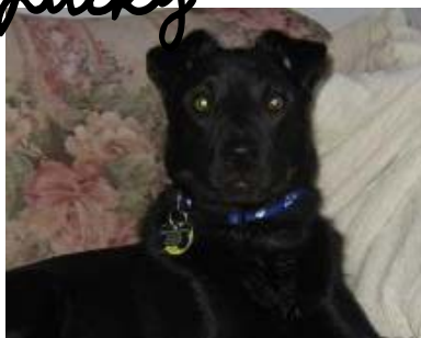
Male Schipperke Mix Found as Stray Adopted August 2007