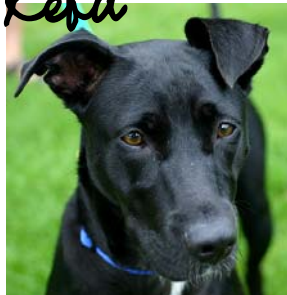
Female Lab/Pit bull Mix Owner Surrender (mother of St. Bernard pups) - Adopted September 2007