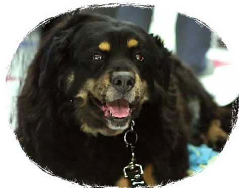
Macy, a former Waggin' Tails rescue dog, sadly became the victim of a vehicle collision after becoming lost. Don't let this happen to your pet!

Annabelle, a very loving and sweet, 6 month old lab/sharpei mix, was thrown out of a moving vehicle. Malnourished & severely neglected, she came to us with NO fur. Annabelle suffers from a non-contagious form of mange. While already on the mend, she is just one example of the many needy dogs we take in monthly.