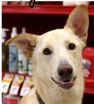
Male Shepherd Mix Owner Surrender Adopted August 2007